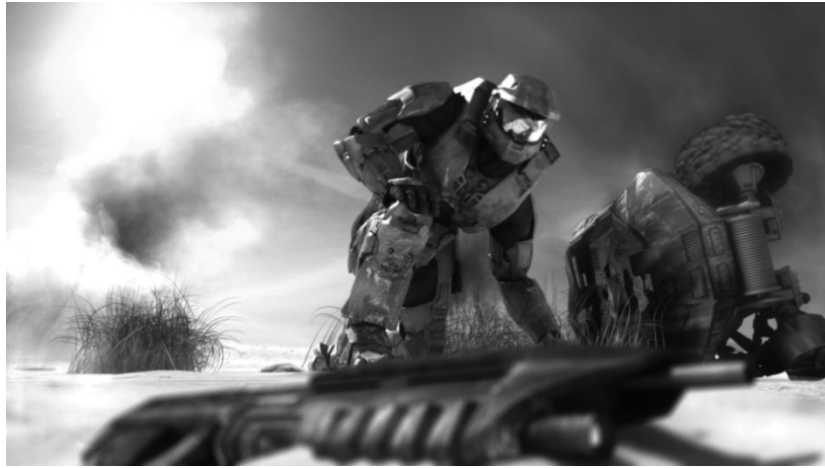
Exhibit 6: Halo 3 154

Covenant forces on the artificially created world of Halo ( a la Rendezvous with Rama ).