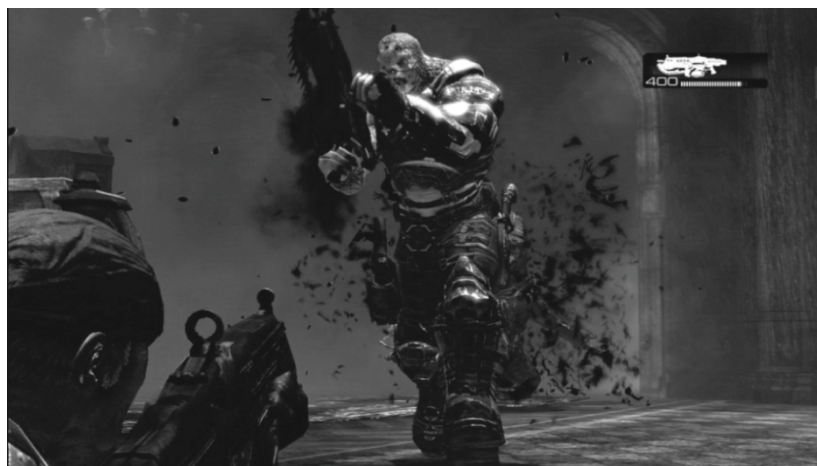
Exhibit 7: Gears of War 158

spontaneous communication in the game compared to the text chat feature of Counter-Strike and other online games.