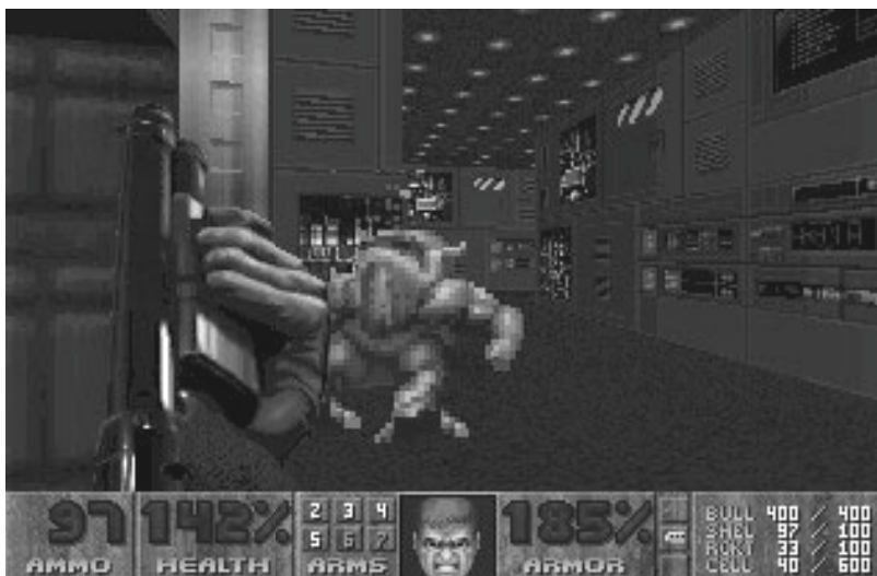
Exhibit 3: Doom 77

their first foray into shooting games, Wolfenstein 3D , there were some players who modified the elements of the game to personalize it. 78 When id made Doom , they took a modular approach to the game's development, allowing players who wanted to customize the game to do so easily. 79 Whereas Wolfenstein was not designed to be expanded, the software architecture of Doom encouraged customization and expansion with the use of "Doom WADs." 80