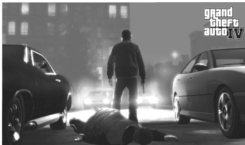
Exhibit 5: Grand Theft Auto IV 105

Take Two Interactive, continued to push the envelope with the next installment of the series in Grand Theft Auto: Vice City , released in 2002. Set in a fictionalized 1980s-era Miami, the game drew heavily from sources like Miami Vice and the Brian DePalma version of Scarface . 104