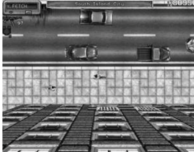
Exhibit 4: Grand Theft Auto 100

Whereas the previous Grand Theft Autos relied on sprite animations hurrying around on a background image of a street, Grand Theft Auto III was rendered in full 3D, and replacing the static top-down camera angle was a swooping third-person perspective at eye-level with the player. 99 This change in the visual structure of the game was ultimately the reason for the increase in controversy between Grand Theft Auto II and III . 101